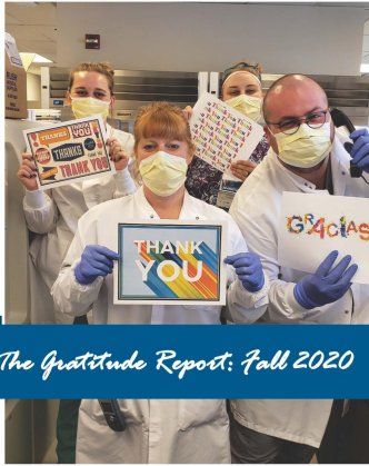
The Gratitude Report: Fall 2020

Providence St. Mary Medical Center has cared for our community in many ways and through many crises since the Sisters of Providence arrived in Walla Walla. Their mission was clear: serve the community's unmet needs.